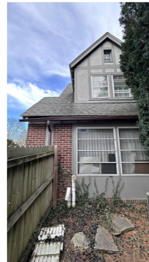
4 EXISTING WEST ELEVATION