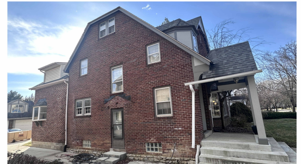
5 EXISTING EAST ELEVATION