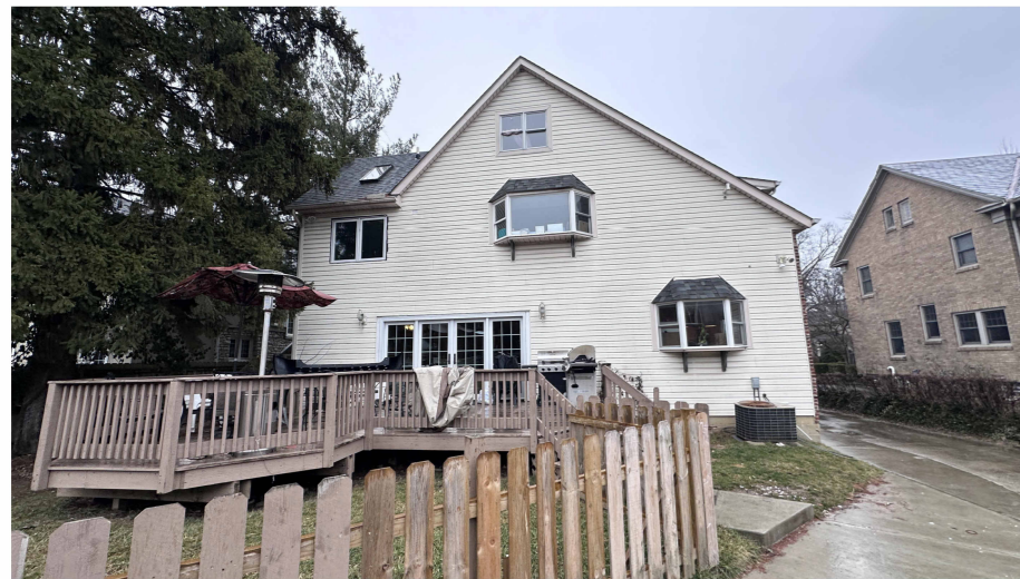
3 EXISTING REAR ELEVATION (SOUTH)