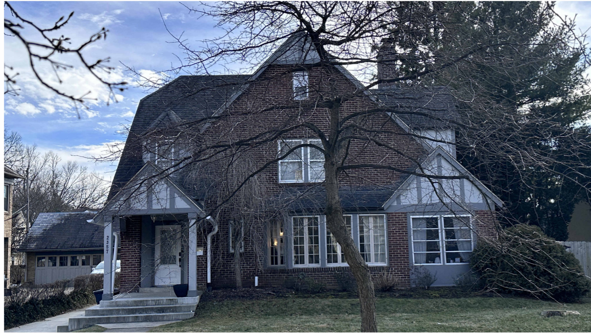
1 EXISTING FRONT ELEVATION (NORTH)