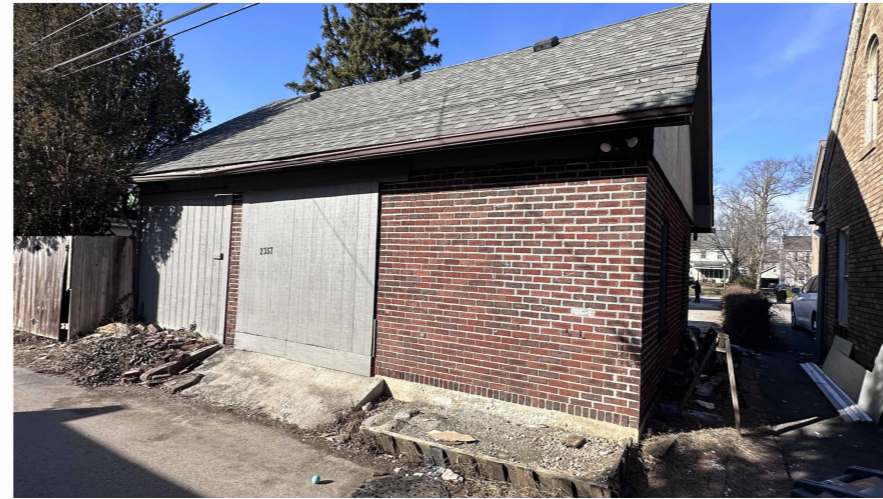
2 EXISTING GARAGE TO BE DEMOLISHED