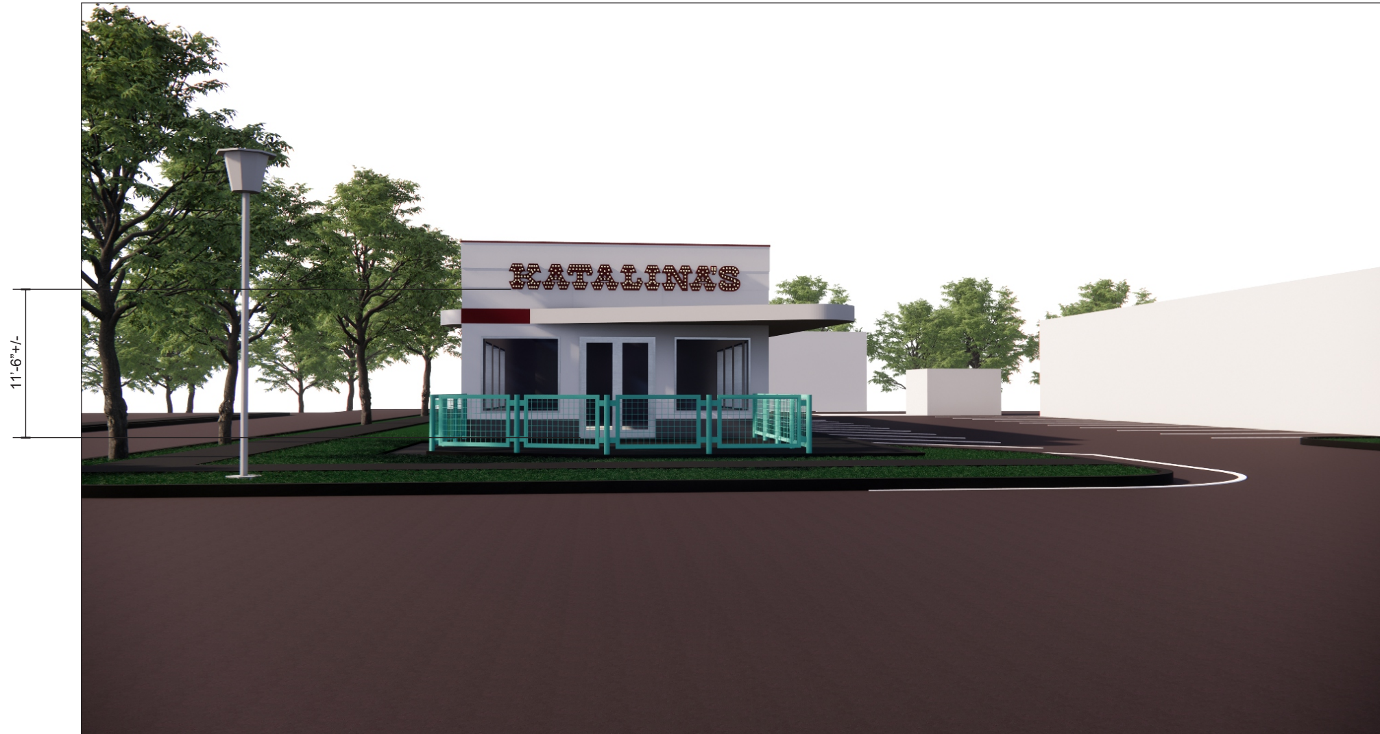
NOT TO SCALE - PROPOSED PLACEMENT ON BUILDING

CONSTRUCTION AND INSTALLATION OF SIGN ELEMENTS TO COMPLY WITH NEC ARTICLE 600 - VERIFY ALL MEASUREMENTS PRIOR TO PRODUCTION