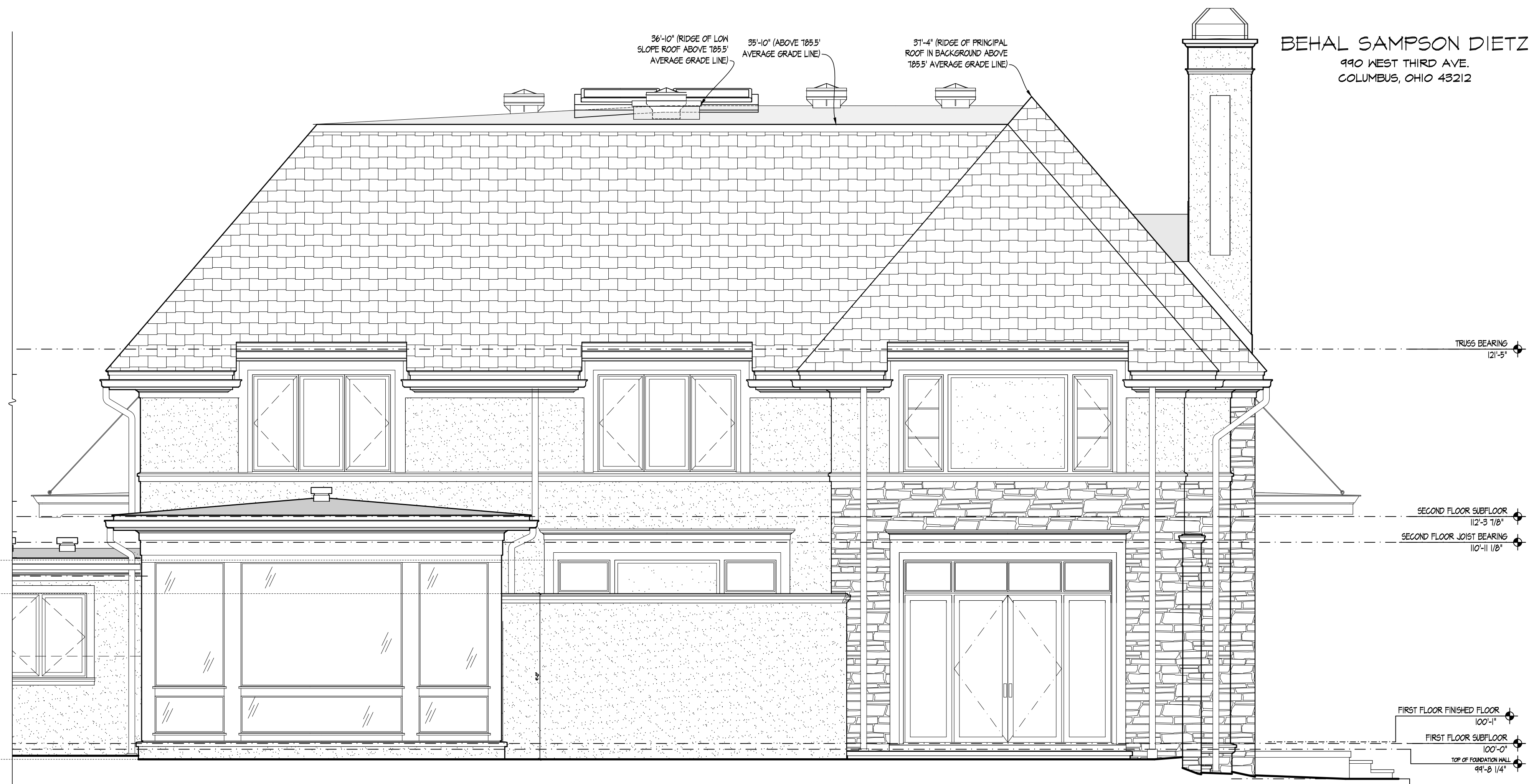
B EXTERIOR ELEVATION SCALE: 1/4"=1'-0"