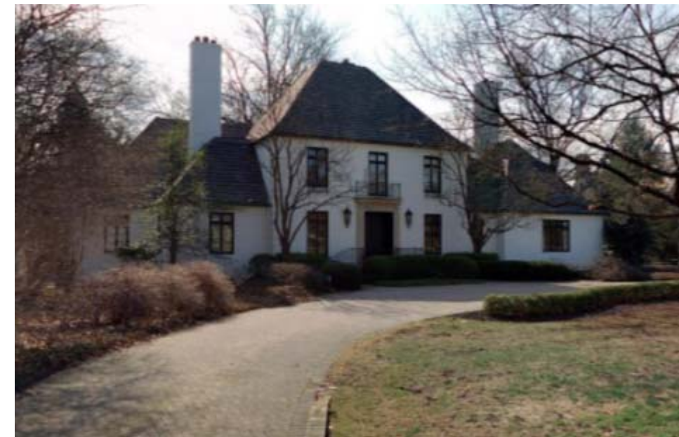
FRONT OF HOME