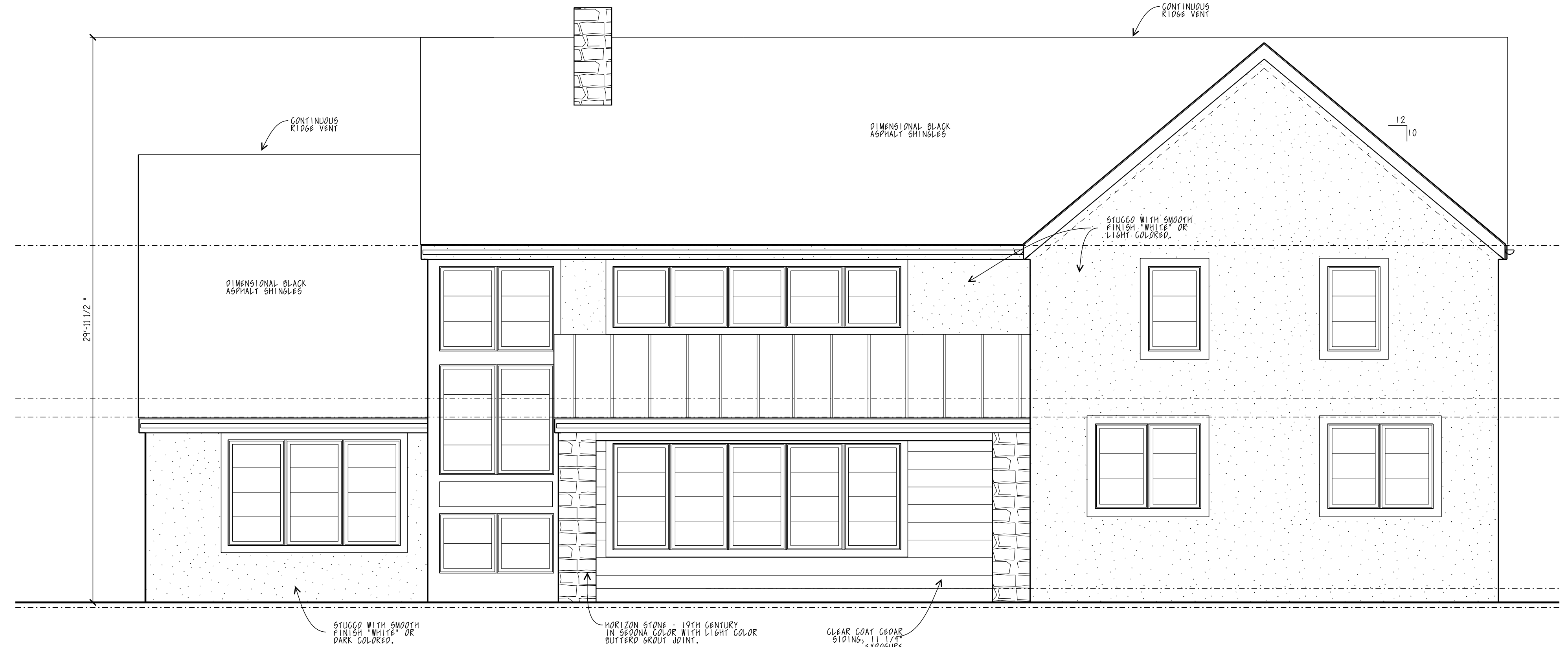
PROPOSED EAST ELEVATION SCALE: 1/4" = 1'-0"