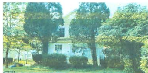
APPARENT ENCROACHMENTS: NONE.

TITLE COMPANY: CLEAN TITLE AGENCY, INC. LENDER: N/A BUYER: BEXMAIN LLC/CITY OF BEXLEY SELLER: N/A DATE: 09/14/2020 ORDER NO.: 0894-20