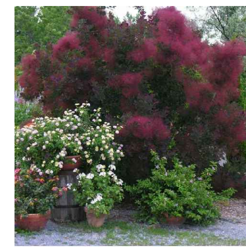
SMOKE BUSH (MAY-JULY)