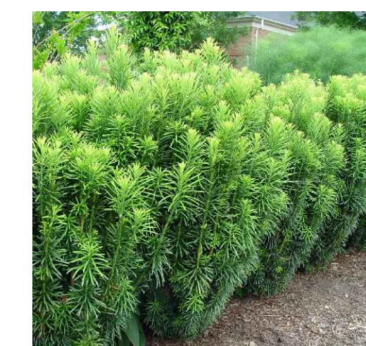
JAPANESE PLUM YEW