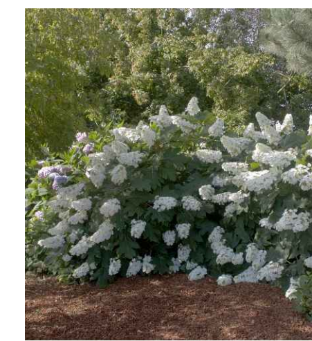
OAKLEAF HYDRANGEA (JUNE-JULY)