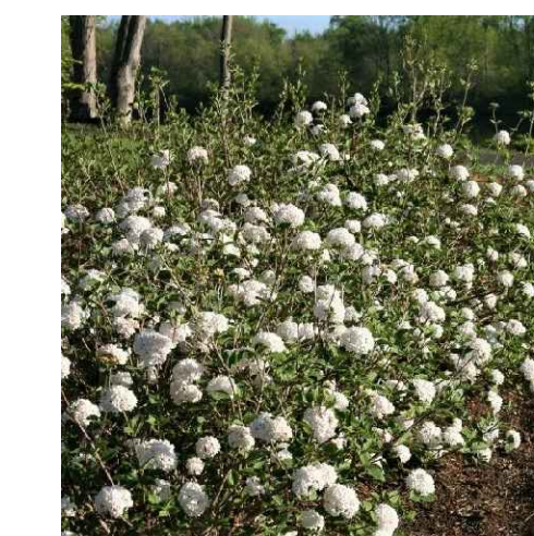
KOREANSPICE VIBURNUM (MAR-APR)