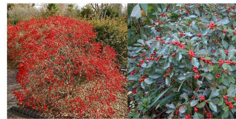
RED SPRITE WINTERBERRY (JUNE-JULY)