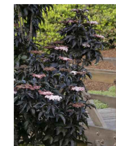
BLACK ELDER (MAY-JUNE)