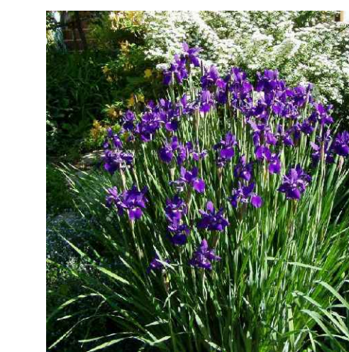
SIBERIAN IRIS (MAY)