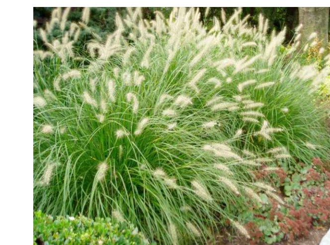
FOUNTAIN GRASS (AUG-OCT)