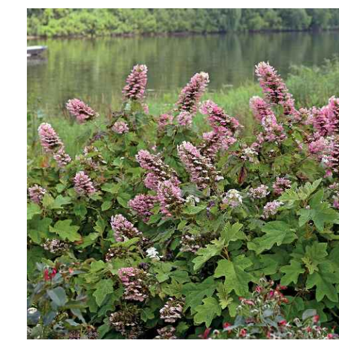
PINK OAKLEAF HYDRANGEA (JUNE-JULY)