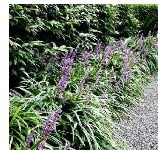
LILY TURF (AUG-SEPT)