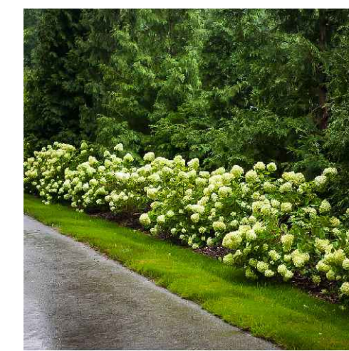
PANICLE HYDRANGEA (JULY-SEPT)