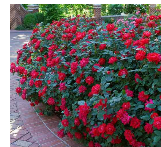
KNOCK OUT ROSE (JUNE-FROST)