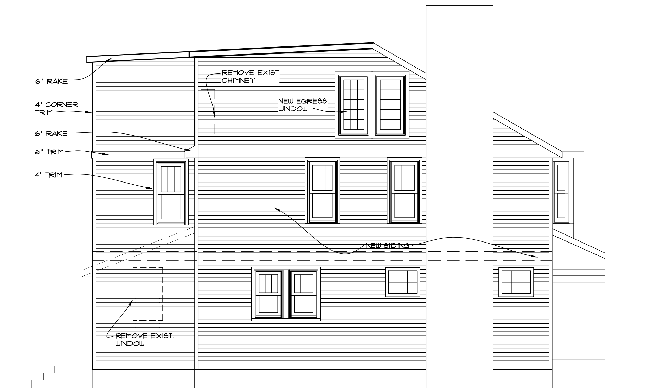
1 SOUTH ELEVATION 4 1/4" = 1'-0"