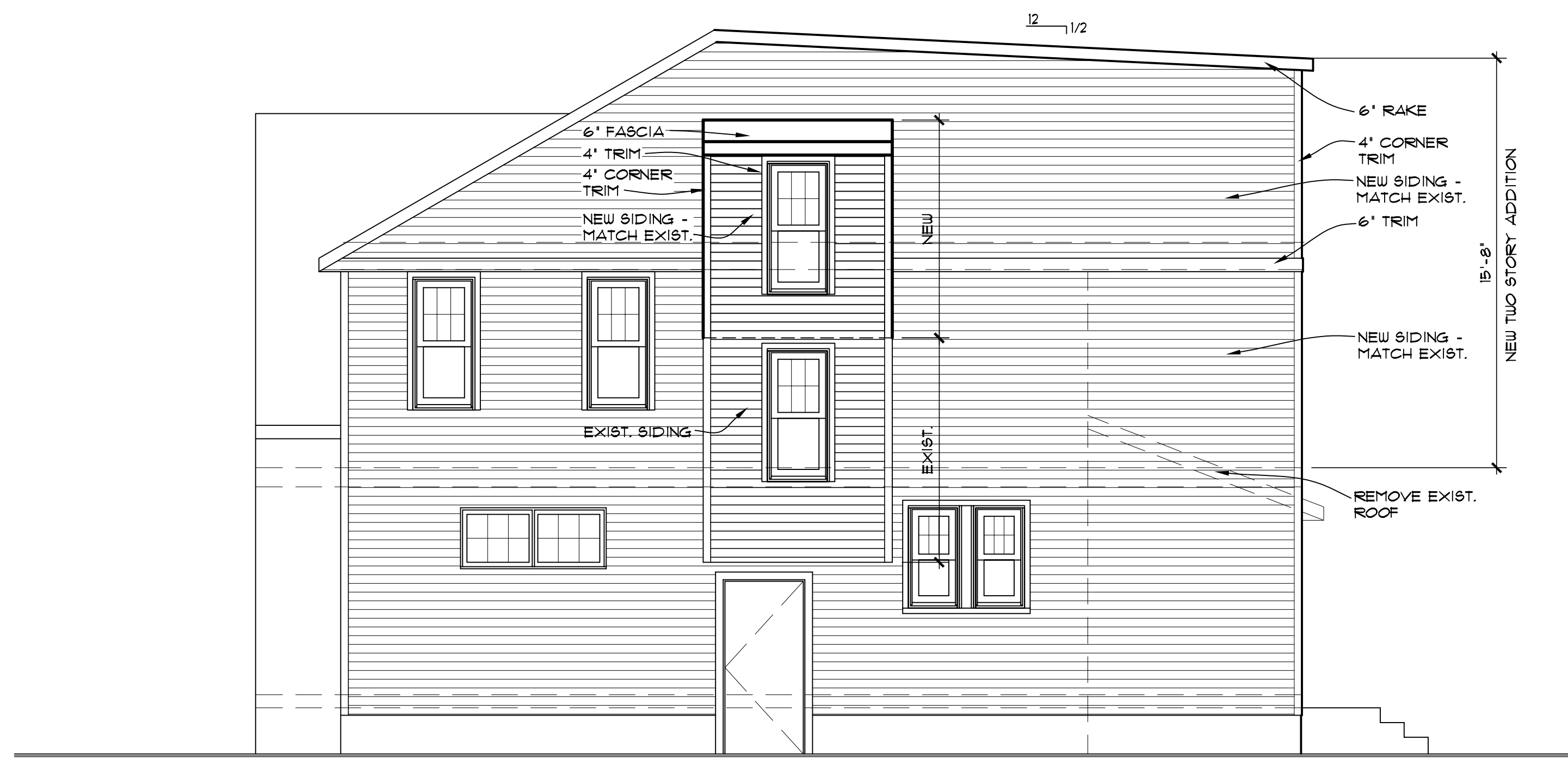
3 EAST ELEVATION 4 1/4" = 1'-0"