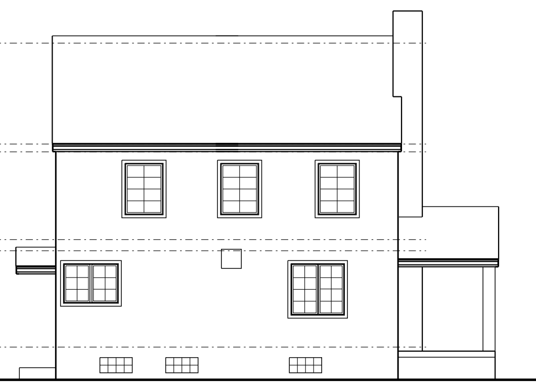
ASBUILT NORTH ELEVATION SCALE: 1/8" = 1'-0"