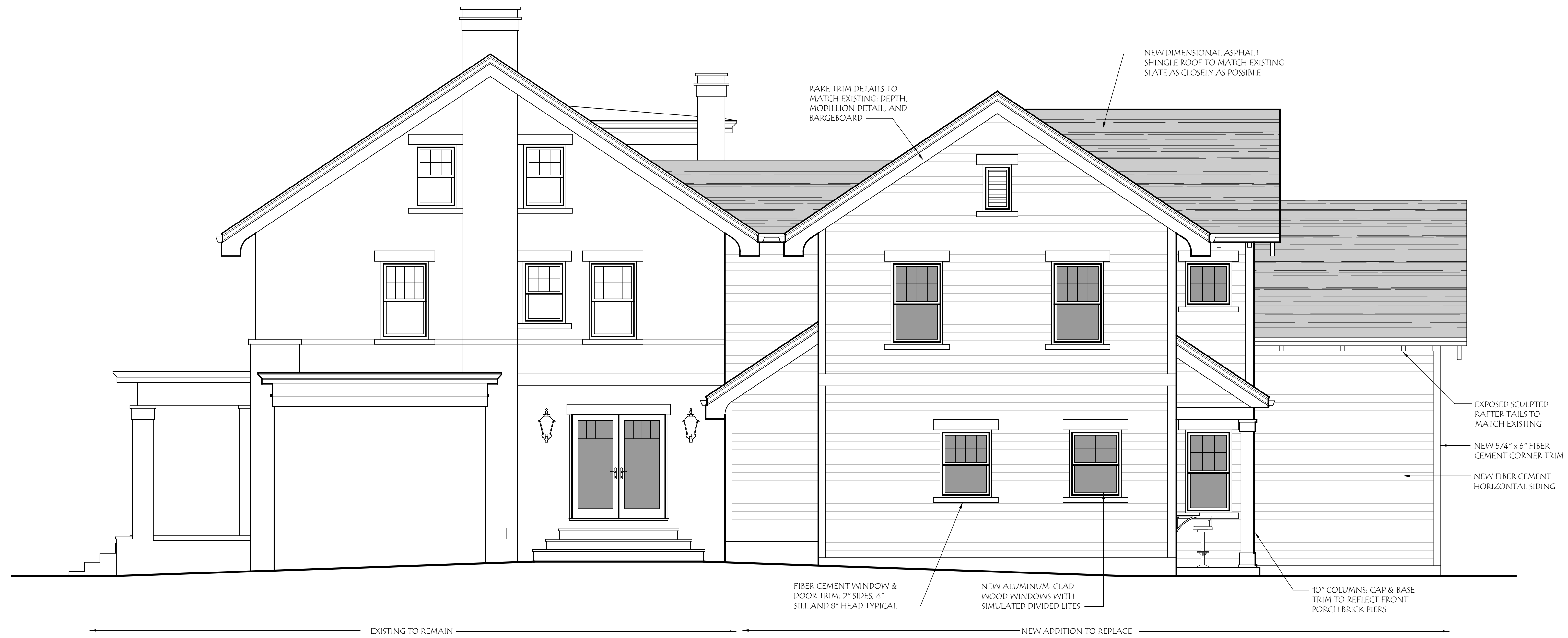
North Elevation SCALE: 1/4" = 1'-0"