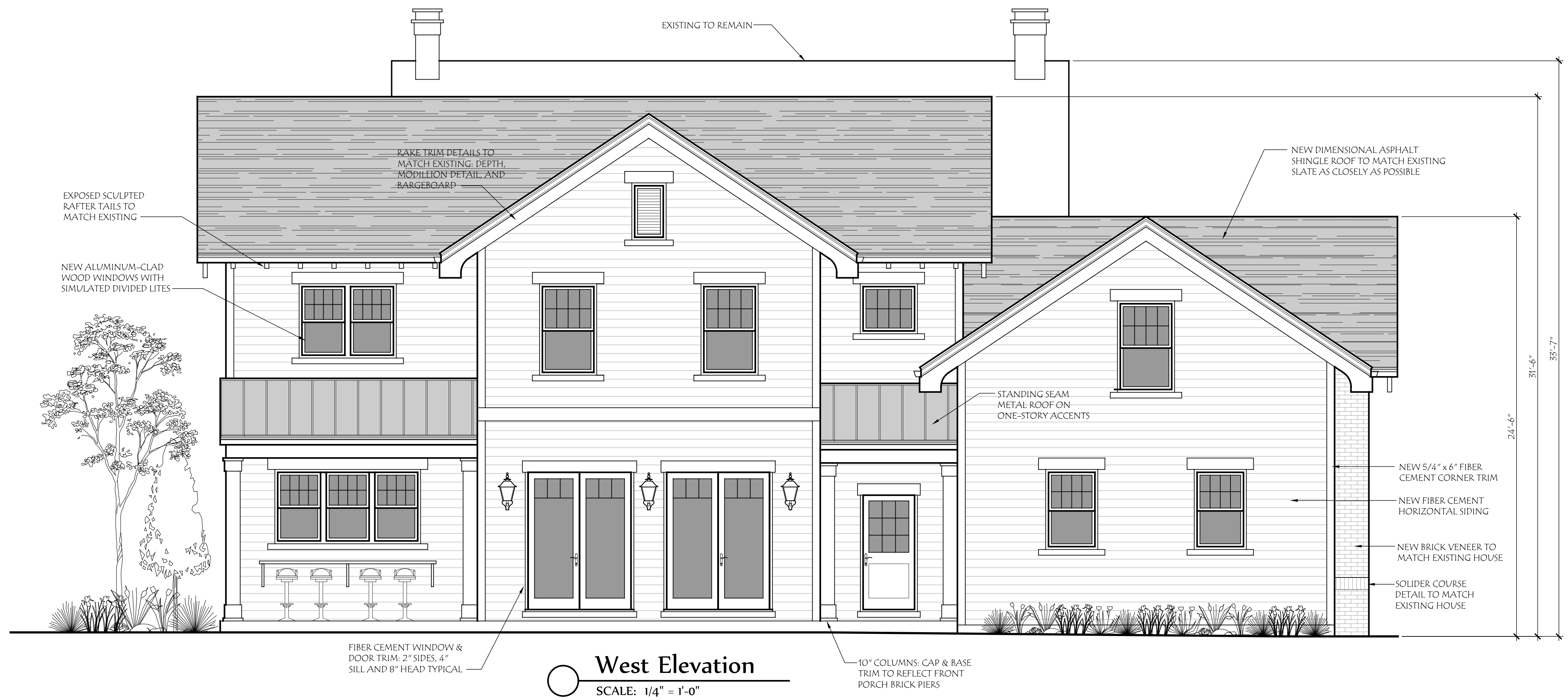
West Elevation SCALE: 1/4" = 1'-0"

LAUERHASS ARCHITECTURE 753 Francis Avenue Bexley, Ohio 43209 614.371.3523 www.LauerhassArchitecture.com Amy@LauerhassArchitecture.com COPYRIGHT LAUERHASS ARCHITECTURE, LLC. ALL RIGHTS RESERVED. THIS DRAWING IS THE PROPERTY OF LAUERHASS ARCHITECTURE, LLC. NO PART OF THIS DRAWING SHALL BE REPRODUCED OR TRANSMITTED IN ANY FORM OR BY ANY MEANS, ELECTRONIC OR MECHANICAL, WITHOUT THE EXPRESS WRITTEN AUTHORIZATION OF THE ARCHITECT.