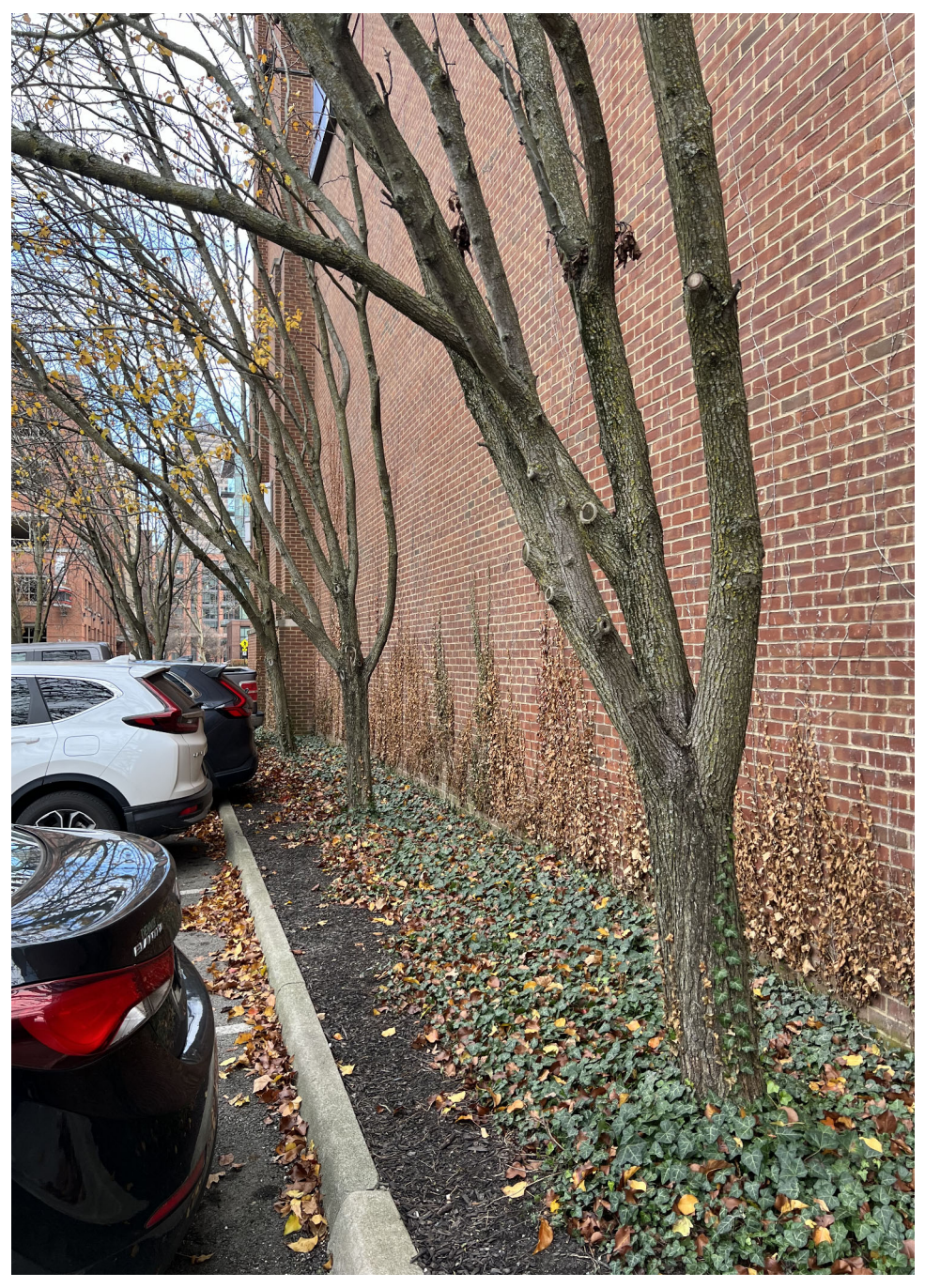
+/-6' plant bed on north side of North Bank Condos at Neil & Spring