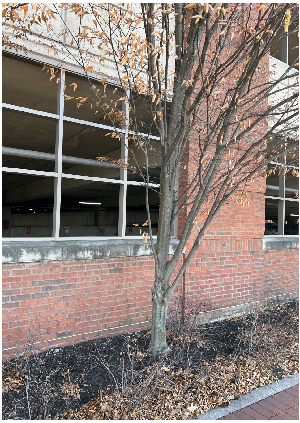
Same bed showing tree +/-2' off of face of building